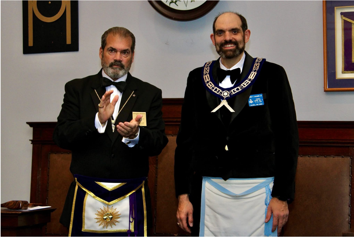
Photo Highlights Installation