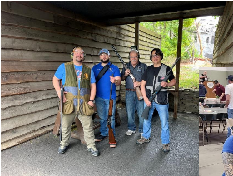
Breaking Clays @ Gothic-Mercer Clay shoot Lehigh Valley, PA May 5, 2025