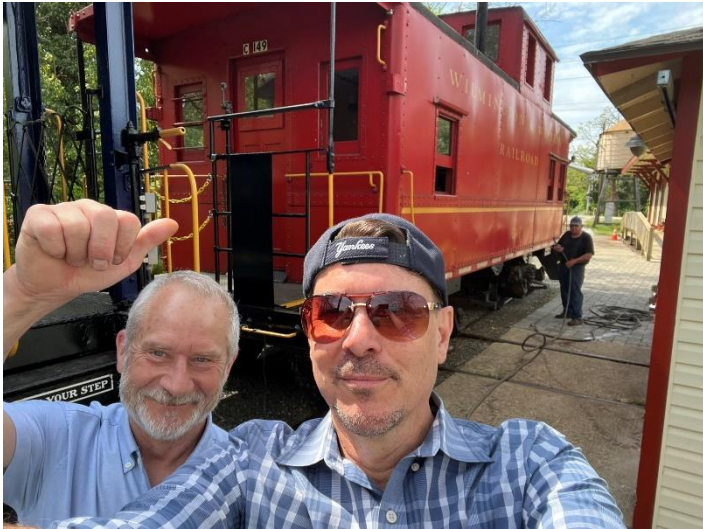
Railroad Degree Wilmington DE May 3, 2025